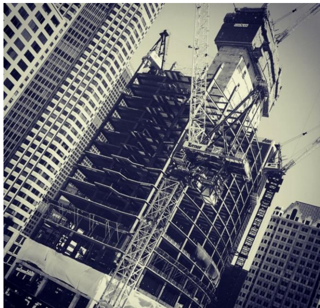
Wilshire Grand Hotel / Wilshire Grand Center - August 2015